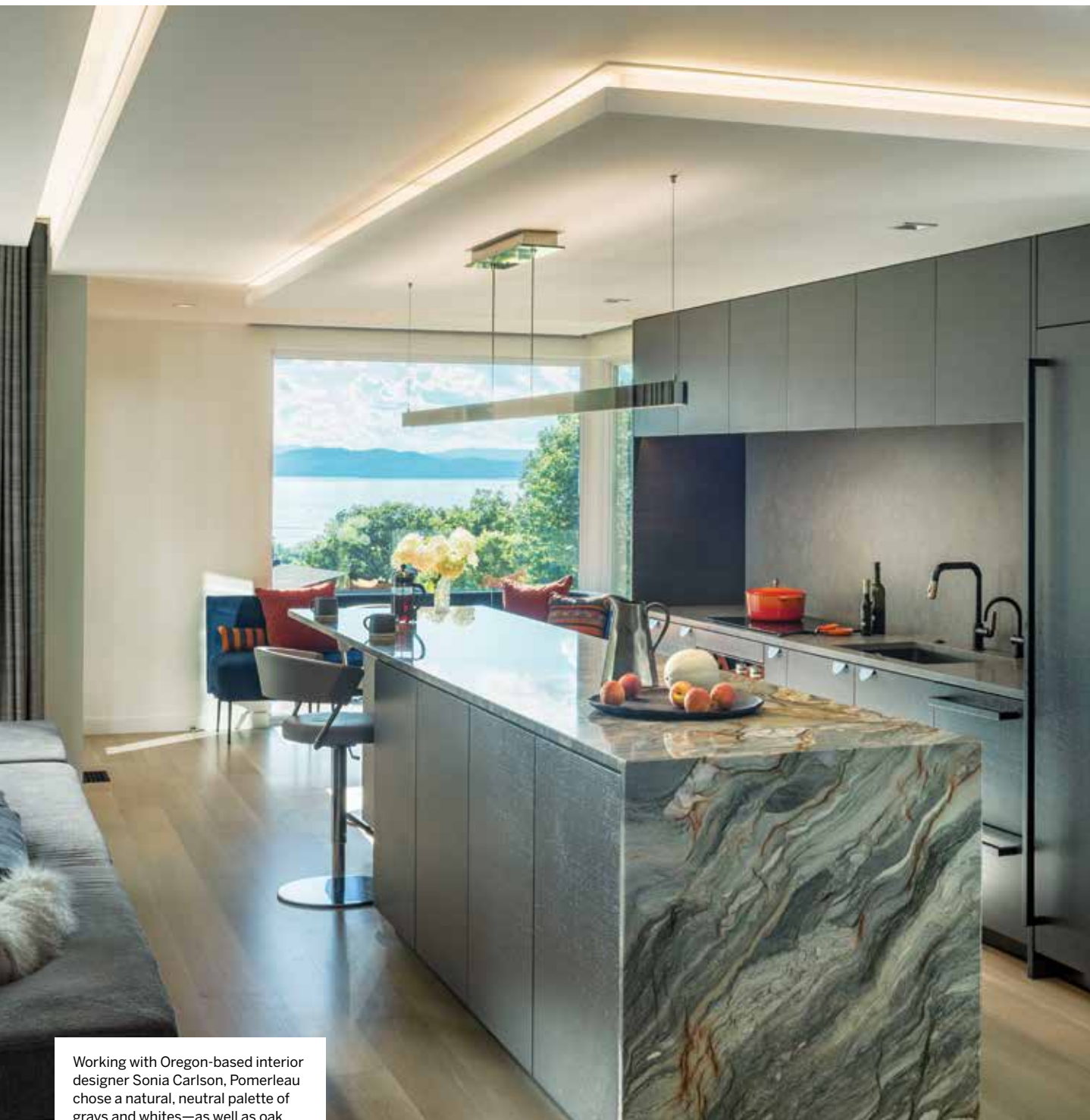
Working with Oregon-based interior designer Sonia Carlson, Pomerleau chose a natural, neutral palette of grays and whites—as well as oak flooring and a quartzite-topped island—for the sleek kitchen. FACING PAGE: The light-filled breakfast/dining nook takes full advantage of the home's views and features two of Philippe Starck's iconic Masters chairs. Orange frosted glass tops the Sovet pedestal table.

when it came time to build, I would do it sympathetically," she explains. "I wanted my home to fit in naturally among the landscape as well as with the rest of the homes on this street."