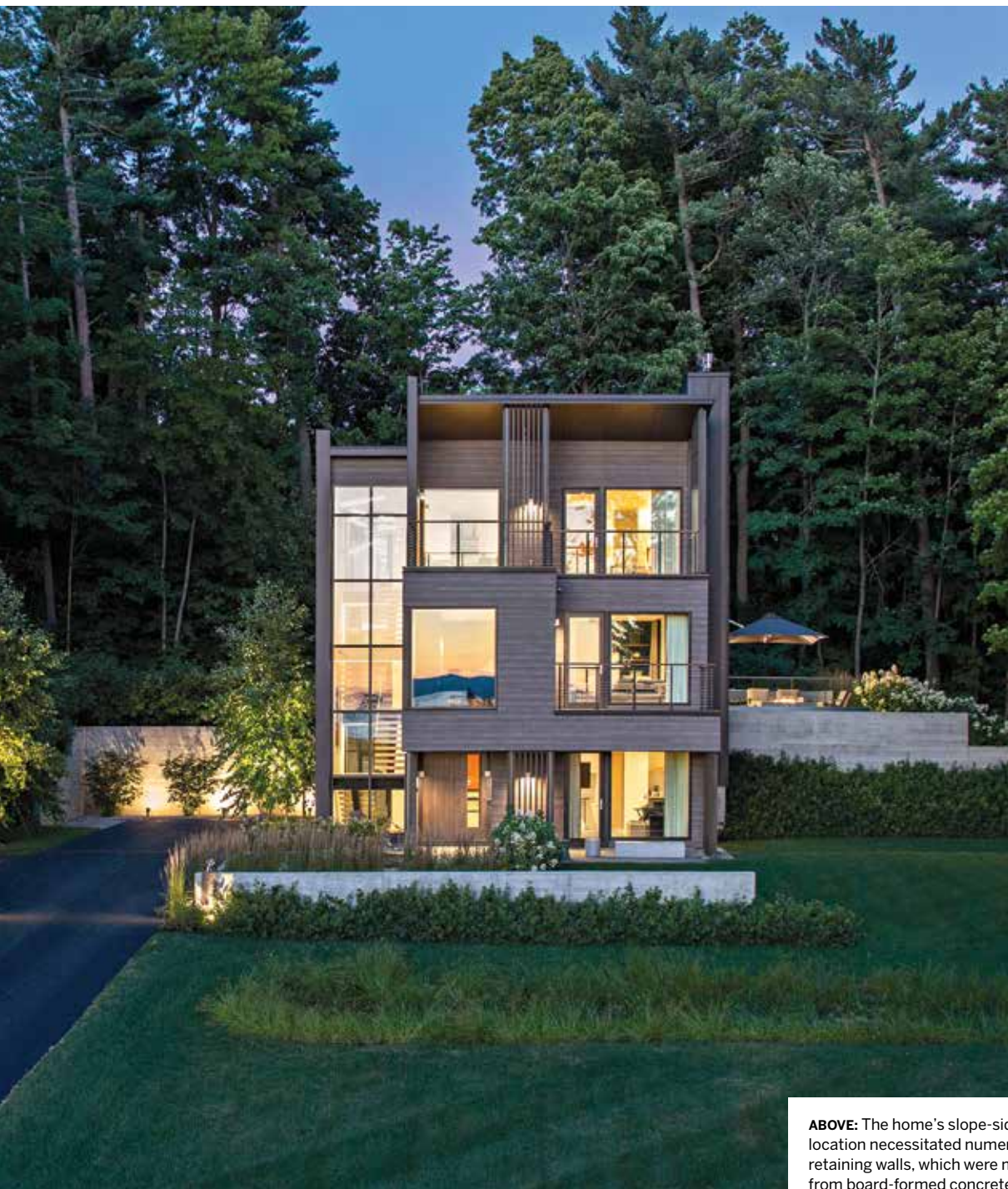
ABOVE: The home's slope-side location necessitated numerous retaining walls, which were made from board-formed concrete. The skillful placement of native plants, grasses, and small trees softens the angles of the walls. RIGHT: A plunge pool, complete with water fountain and firepit, is tucked into a terrace off the main floor that offers views of Lake Champlain and the mountains beyond.

ARCHITECTURE: TruexCullins Architecture + Interior Design